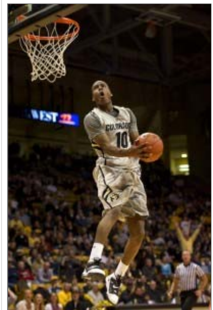
Sophomore guard Alec Burks goes up for a dunk during the first half versus Idaho State at the Coors Event Center Nov.12. The Bufs lost to the Georgia Bulldogs 83-74 Tuesday night. Burks led the game score with 23 points.